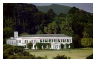
Plantation House: Built in 1792, has been the residence of the Governors