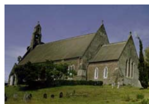
St. Paul's Cathedral: Built in 1851, St. Paul's Church is the Cathedral of the Diocese of St. Helena