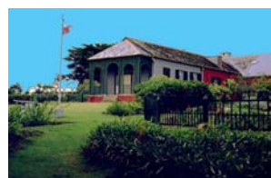
Longwood House: Napoleon's residence for the last year of his life