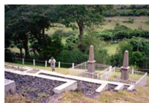
Fort Knoll: Graveyard of Boer POW's who died on the island between 1900-1903

ST. HELENA TOURISM , Canister Building, Main Street, Jamestown, St. Helena Island, Tel. +290 2158, Fax. +290 2159, E-mail: stheleena.tourism@helanta.sh , www.sthelenatourism.com/SDtours.shtml