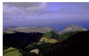
Diana's Peak: Natural Heritage Site, home of island's subtropical plant species